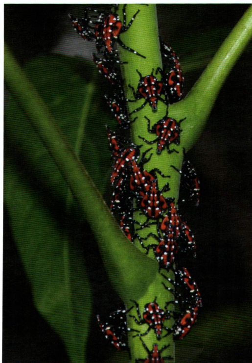
Spotted Lanternfly nymphs on Tree of Heaven.

Quarantine & Status: SLF has recently been detected in Frederick County, Virginia. This fact sheet is to aid in the detection of possible new infestations, since SLF is expanding its range, and the insect can have an important economic impact. SLF has great potential to impact the country’s grape, orchard, logging, tree- and wood-product, and green industries. Suspect insects that resemble SLF can be taken to the nearest Virginia Cooperative Extension county office for identification at no charge. If you have a photograph of a suspected spotted lanternfly, upload it here with the location: https://ask.extension.org/groups/1981/ask . Although there is no quarantine in place, if you have questions about moving material out of infested sites, contact the Virginia Department of Agriculture and Consumer Services at 804-786-3515.